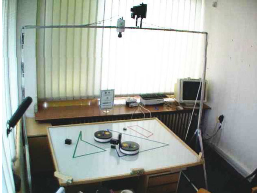
Figure 2: Remotely-controlled robotics laboratory.

The robots are exposed freely on the Internet. Users can control the robots remotely using Internet browser with Java technology enabled. Their movements can be viewed with three cameras (top-view, side-view, and from camera mounted on the robot) in the browser with ActiveX plugin installed, see figure 3. In addition, Internet users can control the robots and view the camera image from the laboratory directly from Imagine Logo programming environment, Java applications, or any application higher-level programming language utilizing the provided DLL or ActiveX software components. The server software allows an easy control of the camera image and bandwidth settings, as well as a calibrated image compensating the distortion by camera lenses.