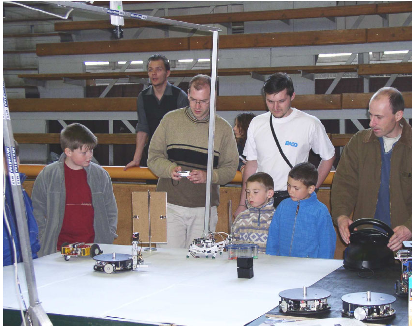
Figure 4: Robots on display at Eurobot'2005 in Prague attracted all ages.

int r = robot_init(1); // create robot object robot_user(r, "john", "turtle"); // provide user/ passwd if (! robot_connect(r, "147.175.125.30")) // connect the lab { printf (" Could not connect \n"); return 1; } robot_alwayswait(r, "on"); // set synchronous mode for (int i = 0; i < 5; i++) { robot_fd (r, 500); // move forward 500 steps robot_rt (r, 1152); // turn 144 degrees right (144*8=1152) // (the precision is 8 steps/ degree ) } robot_close(r); // close the connection